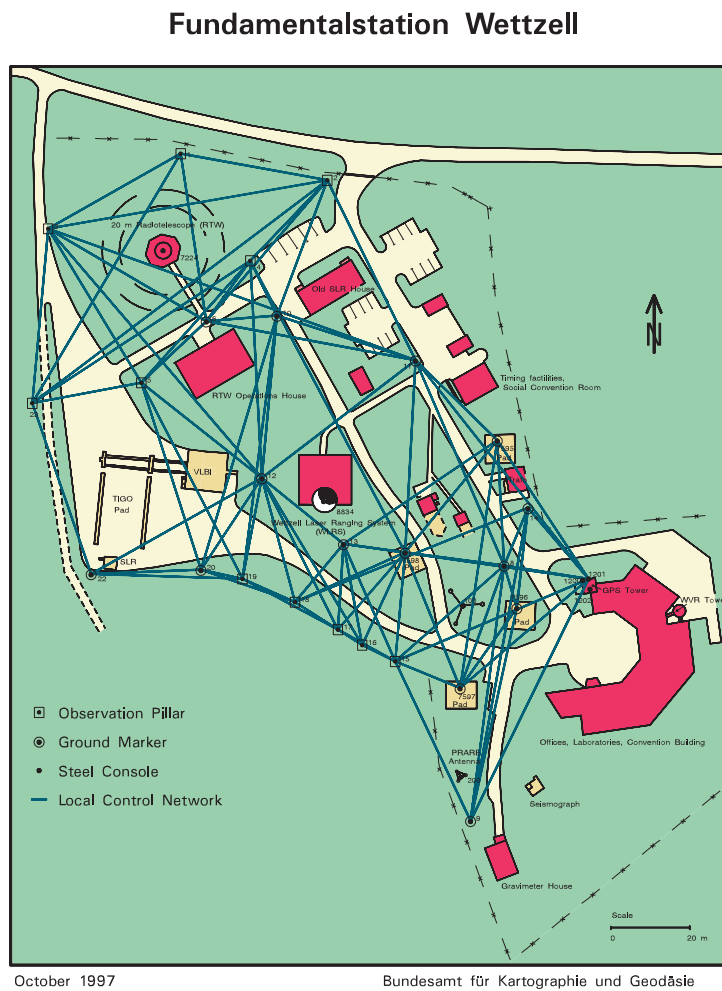
Figure 2. The Local Network Wettzell