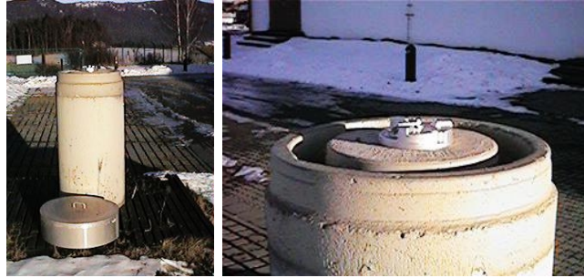
Figure 1. Monumentation Pillar with the force centering